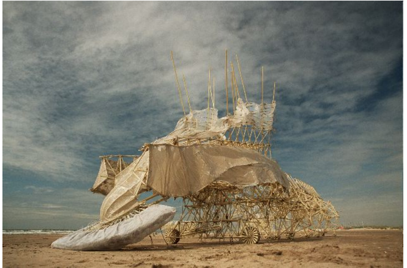
Theo Jansen - Kinetic Sculptor, http://www.youtube.com/watch?v=WcR7U2tuNoY