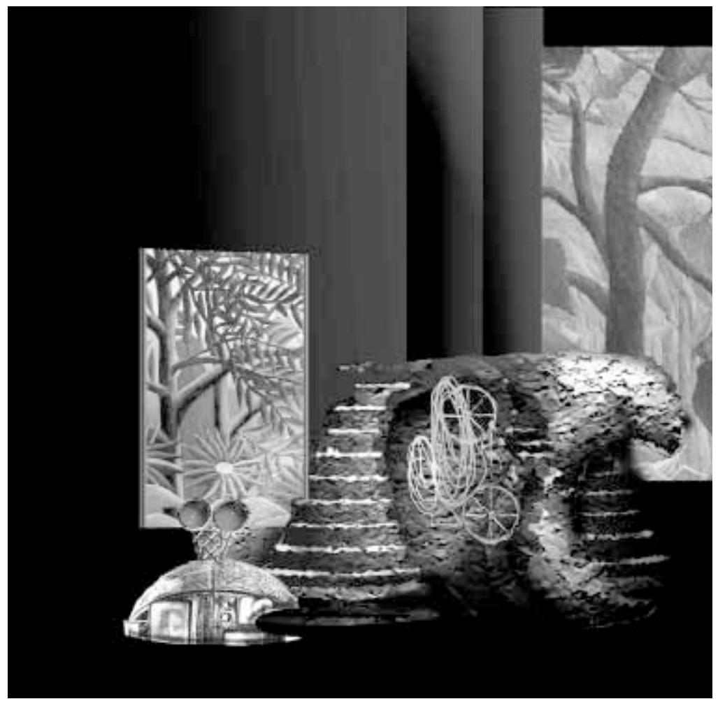
Fig. 6. Scene design rendering by Allen Partridge for the University of Georgia production of The Tempest .

These virtual settings were not static but contained subtle movements: waves slowly rolled in and out, trees and grass swayed gently in the wind, and butterflies fluttered past to punctuate romantic moments. 12 As the characters moved throughout the island (or at least thought they were moving throughout the island), the landscape reflected changes in location as well as in weather and time. These virtual scene changes and the movements within them were triggered using an offstage MIDI keyboard, precisely as in Hair . We used this same technique for special effects throughout the production. For example, a food-filled banquet table appeared to tantalize the nobles in Act Three, fantastic animated creatures performed a wedding ceremony during the masque in Act Four, and a video image of Miranda and Ferdinand playing chess appeared inside an oversized moon in Act Five.